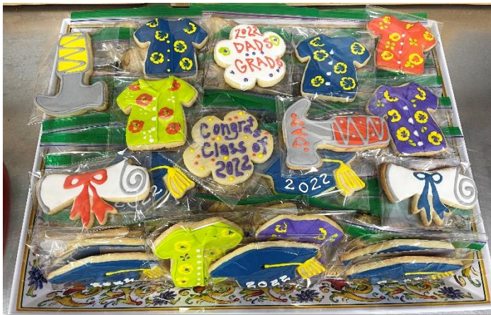
Cookies for Dads & Grads Service