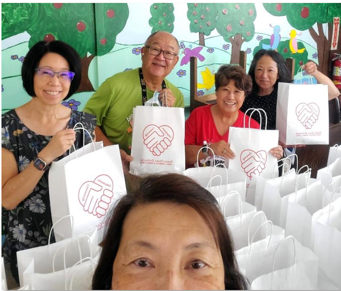
Dana Delivery Prep

The Senior Dana Deliveries was coordinated by Dharma School in August. We prepared the bags on Aug. 27th to be delivered on the 28th. The contents included somen or soba, tsuyu sauce,