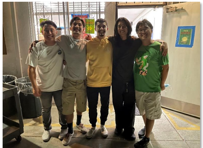
Some Dharma School alum who helped out with obon cleanup

Dharma School was very busy coordinating the Plinko game booth for the VJCC Festival on June 25. Thank you to all who helped with a shift that day. We ended up giving out more than 600 prizes. Obon weekend followed shortly thereafter. Dharma School is very grateful for the many temple members, family and friends that came to support us by working Saturday and/or Sunday in the Obon Food Booth. Special thanks to the many high school students that helped us throughout the weekend. We sold out of hot dogs, veggie dogs, chili rice, salads and sushi.