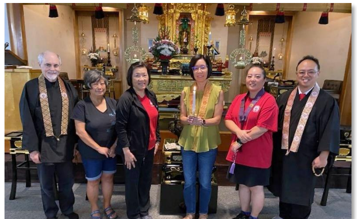
Dharma School Staff Installation