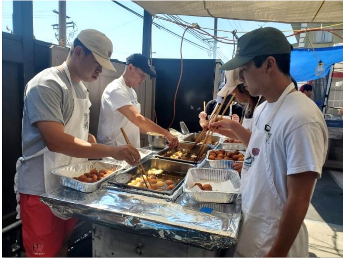
Frying the dango (andagi)

burners, with a large rectangular pan that fried 60 wonton at one time.