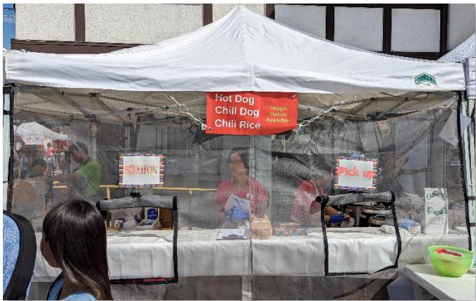
Dharma School Booth at Obon