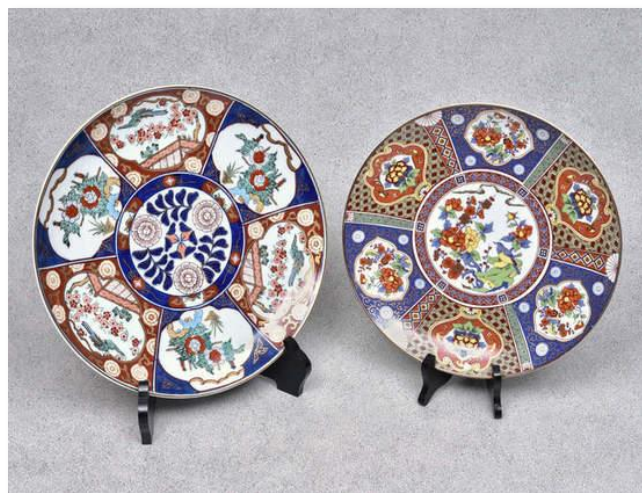
Platters, dishes, bowls, and tea cups sold well