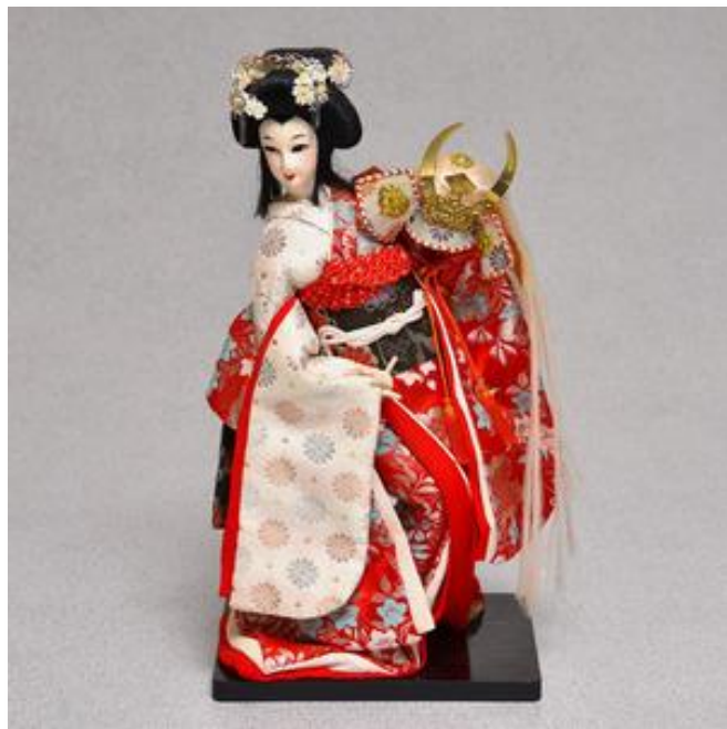
Large, decorative dolls did not sell

appointment to select the items most likely to sell at the October 2022 Virtual Lumbini Boutique.