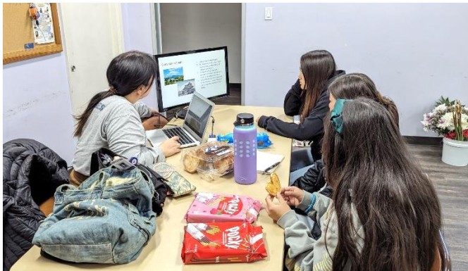
Middle School Class