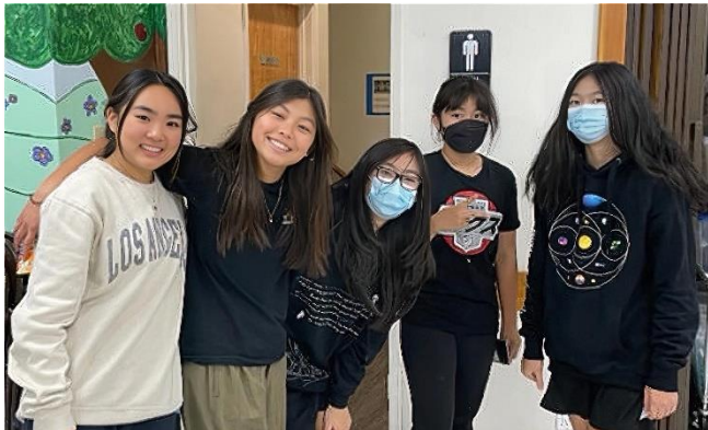
Thank you to Sangha Teens for papering the floor

On Thursday morning and evening, and on Friday morning and evening, Temple members came out to help wash and slice 5 ingredients: carrots, gobo, kamaboko, shiitake, and takenoko. Garnishes included the thin sliced eggs, parsley, and red ginger or beni shoga.