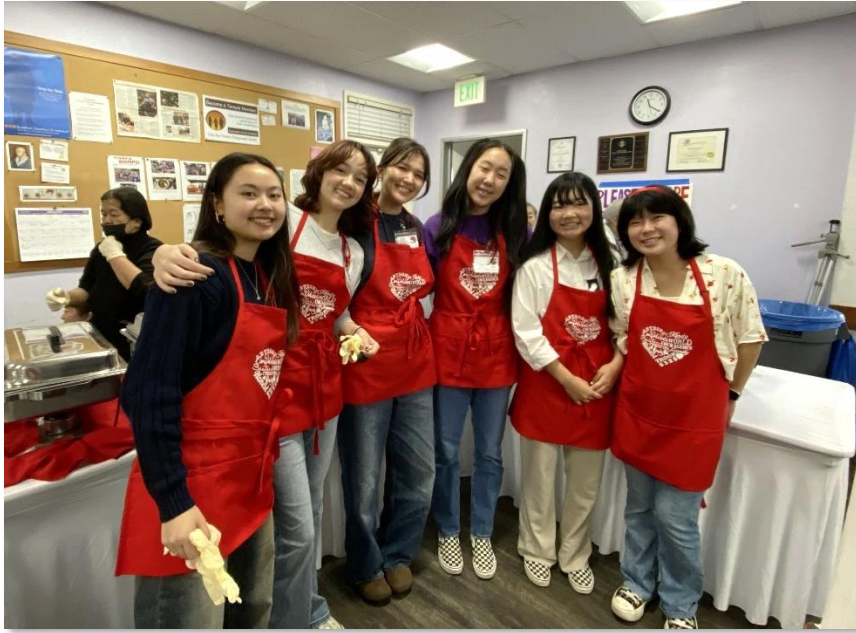
Ambassadors had fun helping out at the Temple's Shinnenkai celebration!

The Daisies learned all about selling cookies at our troop cookie kick off meeting.