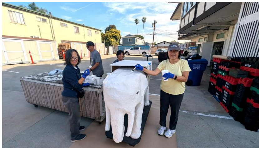
Painting the Elephant for Hanamatsuri