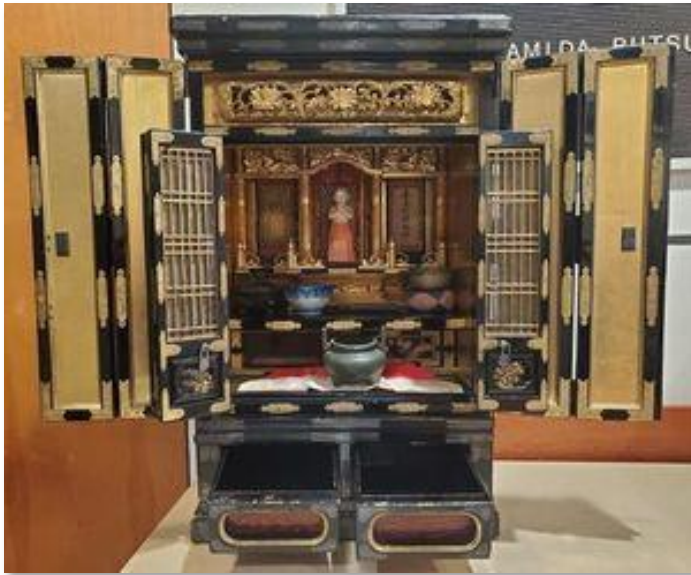
Tabletop Obutsudan sold at 2021 Virtual Lumbini Boutique

Thanks to the success of the 2022 Virtual Lumbini Boutique, a shed still full of inventory, and additional donations from generous Temple members and their families, the VHBT BWA will hold another 2023 Virtual Lumbini Boutique, October 1 – 31, 2022. The www.32auctions.com/Lumbini site will be accessible in September, but “buy now” purchases will begin on October 1st. Flyer at the end of this newsletter.