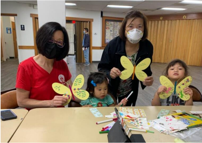
May Dharma School Class