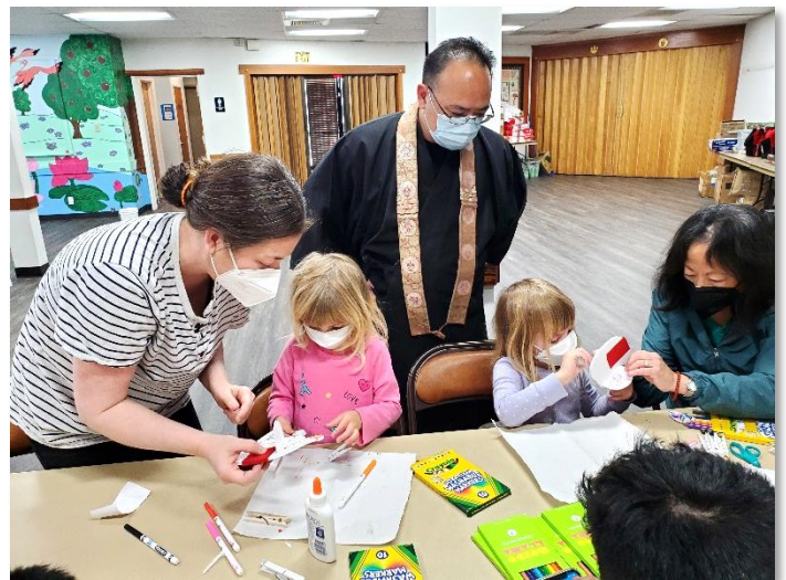
April Dharma School Classes