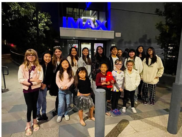
The troop had lots of fun, too! A highlight was seeing the Taylor Swift Eras Tour movie on the big IMAX screen!