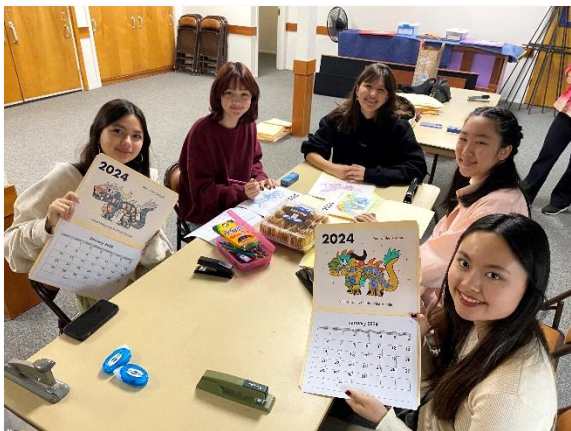
Our Ambassadors assembled the calendars sent to Dana Delivery recipients as well as Kei Ai Nursing Home.