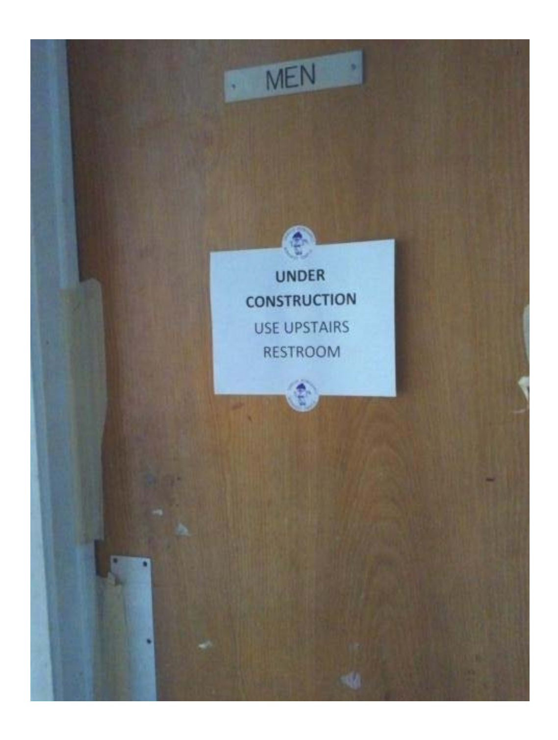
MESSAGE FOR MEN ONLY