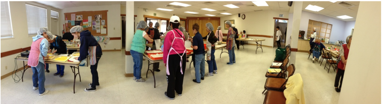
MORE SUSHI MAKING CLASS